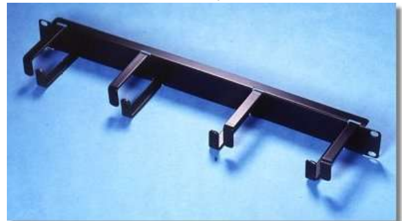
Heavy Duty Cable Management Panel