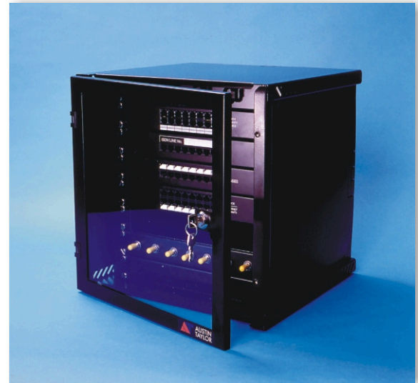
MiniPatch V2, plain door style

A wide range of accessories is available for the MiniPatch allowing it to be used for many applications including PBX, Ethernet, Token Ring and ISDN. (See below for details)