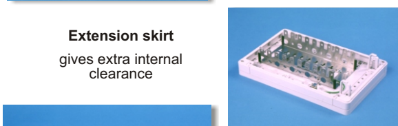
Extension skirt gives extra internal clearance