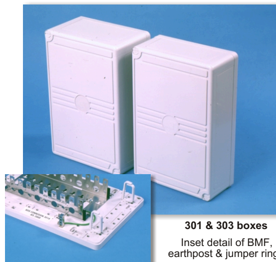
301 & 303 boxes Inset detail of BMF, earthpost & jumper rings

The 300 Series box can be used singly or in multiple configurations when the bases are fitted together with base clamps and side or end panels removed.