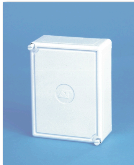
250 Series box

The 250 Series box can be used singly or in multiple configurations when the bases are fitted together and the appropriate side or end panels removed.