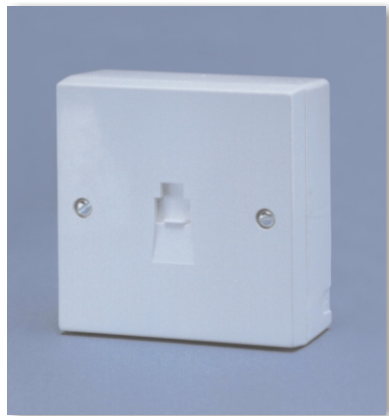
2 Series RJ11 linejack supplied with backbox